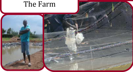
Release of 1,000 tilapia fingerlings