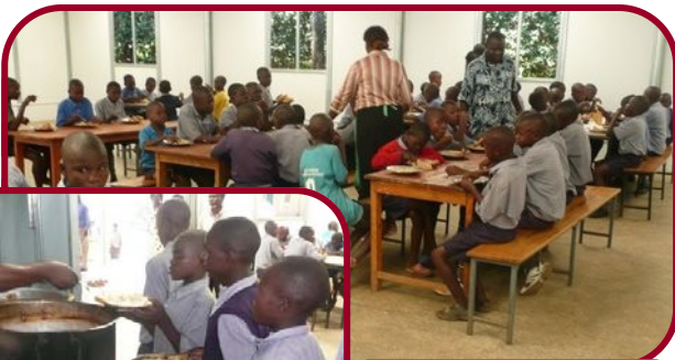
Lunch in the new dining hall

Thank you to all of you who have prayed for us, encouraged us, and supported us with your finances. We are grateful to you and to the Lord for you. We wish you and your loved ones a very special Christmas. May you experience Christ's love and peace and forgiveness in greater measure than ever before.