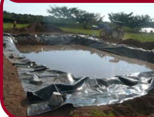
Fish pond on The Farm

As we look back on the year, we are grateful for all of those who visited us in Kenya. (During this past six months, there were only two days when we didn't have at least one visitor, frequently two or three, and as many as 19.) It was a joy to have each one of you with us. Thanks for your help and encouragement and for loving our Agape kids. We hope you'll come again.